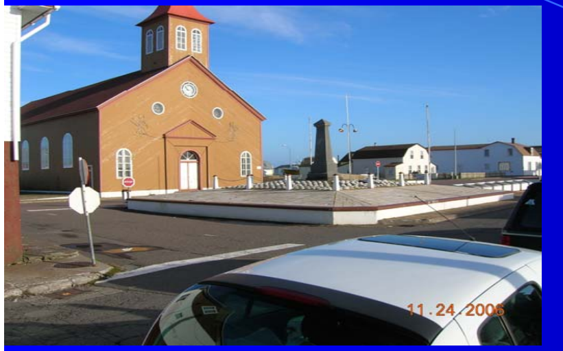
The town square...